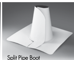
Split Pipe Boot