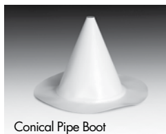
Conical Pipe Boot