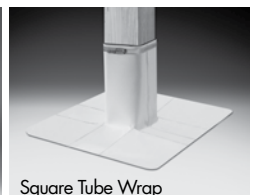
Square Tube Wrap

Quality You Can Trust... From North America's Largest Roofing Manufacturer!™