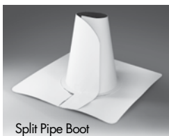
Split Pipe Boot