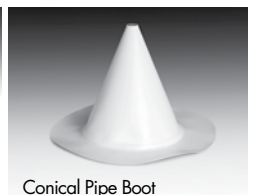
Conical Pipe Boot

Quality You Can Trust... From North America's Largest Roofing Manufacturer!™